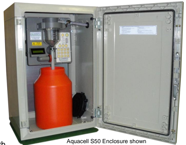
Aquacell S50 Enclosure shown with 12 litre Container